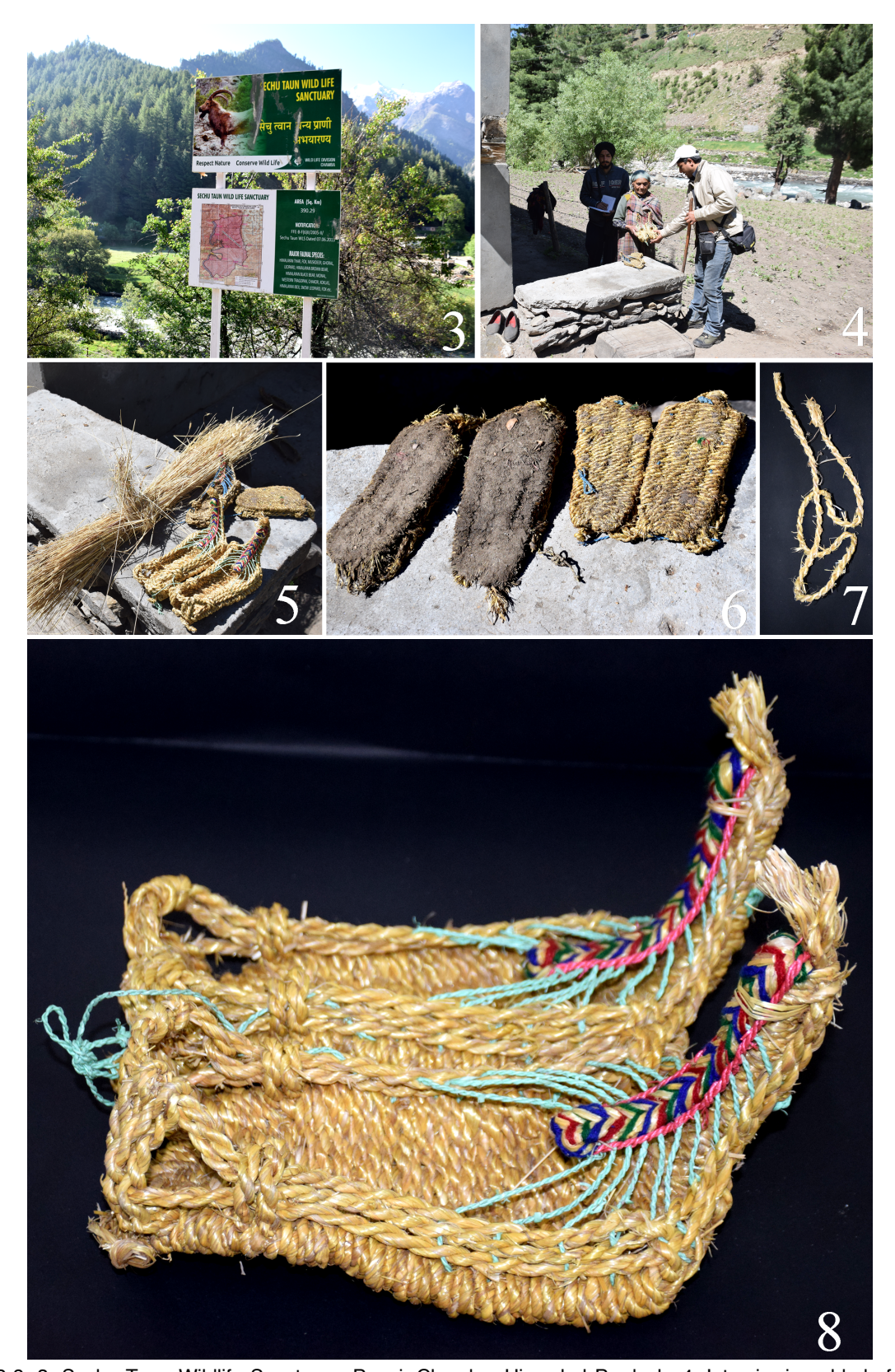
Fig. 3-8. 3. Sechu Tuan Wildlife Sanctuary, Pangi, Chamba, Himachal Pradesh; 4. Interviewing elderly female member of Pangwal tribe for documentation of process of Pullian making; 5. Pullian or snow shoes with raw material 'straw'; 6. Used Pullians ; 7. Rope made from straw; 8. Pullian .