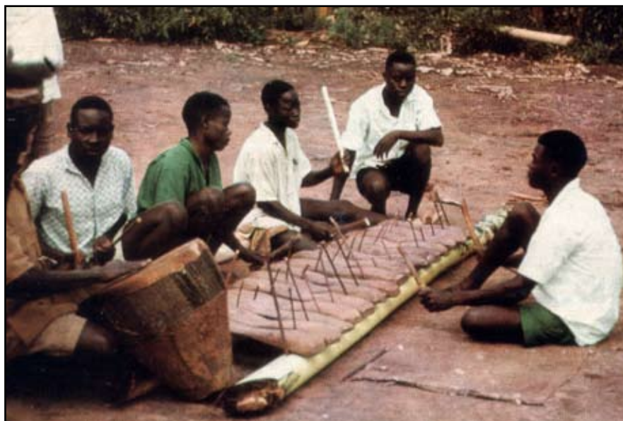
Figure 3. Banana-stem xylophone in Busoga, Uganda.

taro was well established in Senegambia by A.D. 1500, too early for Portuguese navigators to have been instrumental in its diffusion. In the monumental dictionary of Duala by Ittmann (1976), Colocasia is deeply embedded culturally in the coastal areas of Cameroun. The Duala recognise 14 cultivated varieties and have a complex specia-