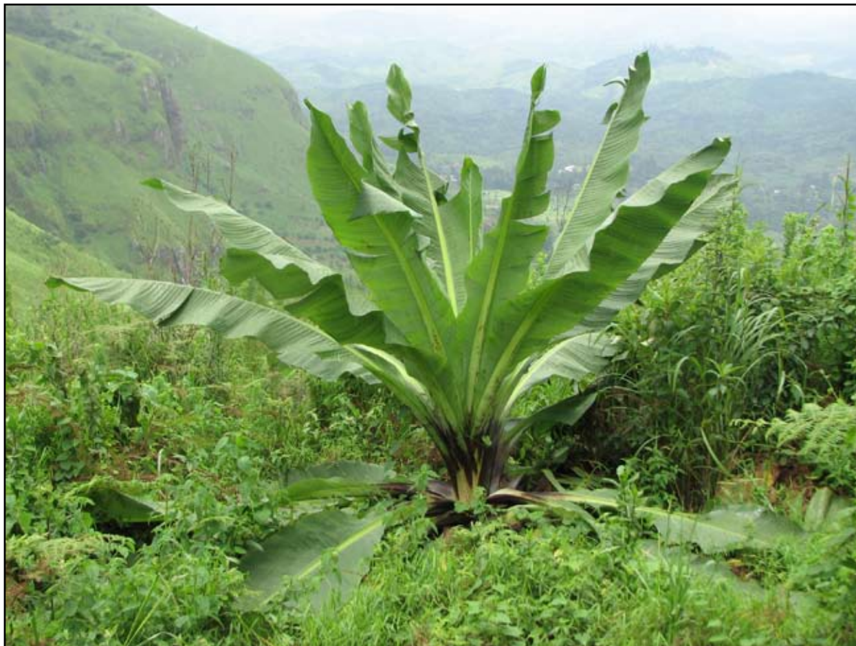
Figure 1. Ensete gillettii (DeWild.) Cheesman near Bamenda, Cameroun.