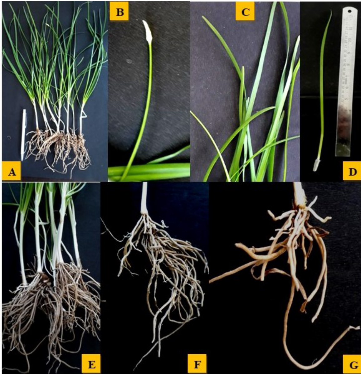
Figure 1. Morphological features of Allium wallichii Kunth (Where, A: whole plant; B: scape; C: Leaves apex; D: Whole leaf; E, F and G: Bulbs with roots).

for field culture was established earlier (Wawrosch et al. 2001, Shahzad & Shaheen 2013). Additionally, protected cultivation, information and training to farmers about A. wallichii may be useful for maximum utilization and exploration the economic potential in terms of health benefits in near future.