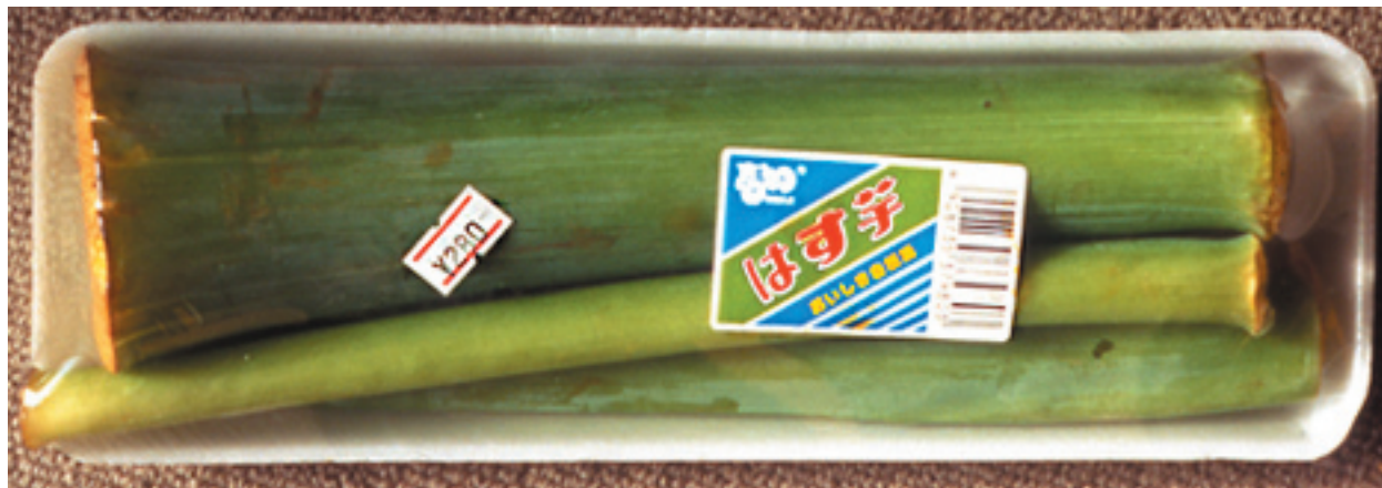
Figure 10. Edible petioles ( zuiki ) from C. gigantea ( hasu-imo ) as sold in a supermarket in Kyoto city, Japan (July 1996), Only one cultivar of this species is known in Japan.

Analyzing the data in Japanese Food Eating Styles has only just begun. Initial examination indicates that the diversity of culinary methods applied to taro is positively