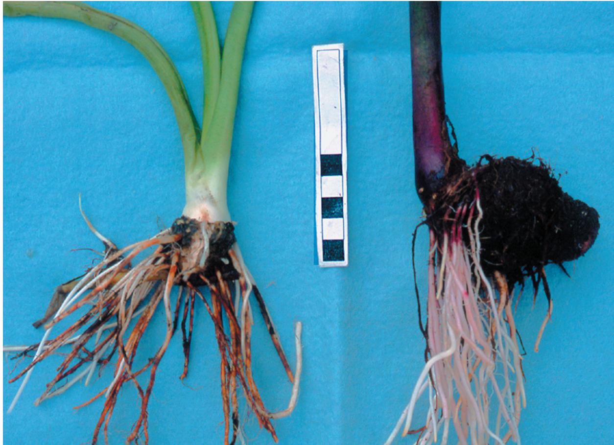
Figure 2. Wildtype taro (green petiole with stolons and small corm) and a domesticated form (purple petiole with larger corm) from a stream on Amami Island, in the Ryukyu Archipelago of southern Japan. The wildtype is locally recognised as a plant that was used until the mid-20th century as pig fodder, after cooking. The plants shown here grew side-by-side on a gravel stream bank, below the site of a former settlement. The wildtype is commonly found in disturbed habitats near past or present settlements. The domesticated form is presumably a garden escape, and was not seen in other locations with the wildtype. (April 2001).

Taro in its natural state is a semi-aquatic tropical herb, and can easily become weedy in disturbed or managed habitats that are warm, wet and open to the sun (Figure 2).