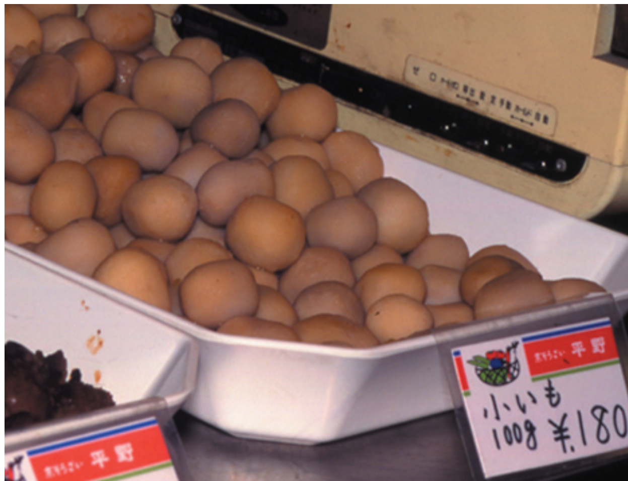
Figure 7. Small child-corms ( ko-imo ) after boiling in a flavoured sauce, and sold as fresh product, in Kyoto, Japan.

Taro dishes commonly referred to as nimono (boiled materials, Figures 7 & 8) and miso-shiru (hot soups made with paste from fermented soybean as flavoring) are most common. These kinds of dishes are not unique to taro, and are found everywhere in Japan. They are mainstay side-dishes, almost always eaten together with rice, and taro is just one of many possible ingredients that can be used. The encyclopedia Japanese Food Eating Styles also mentions many taro dishes just once or a few times. These may include uncommon dishes that are not widely known, and common dishes that have many different names. Specific taro cultivars may be used for specific dishes, but in most cases, taro is not referred to using cultivar names. Dishes in which taro is boiled and then mashed and flavored in various ways appear to be a distinctive component of cuisine in the far southern islands of Japan. These mashed taro dishes - numuni and others