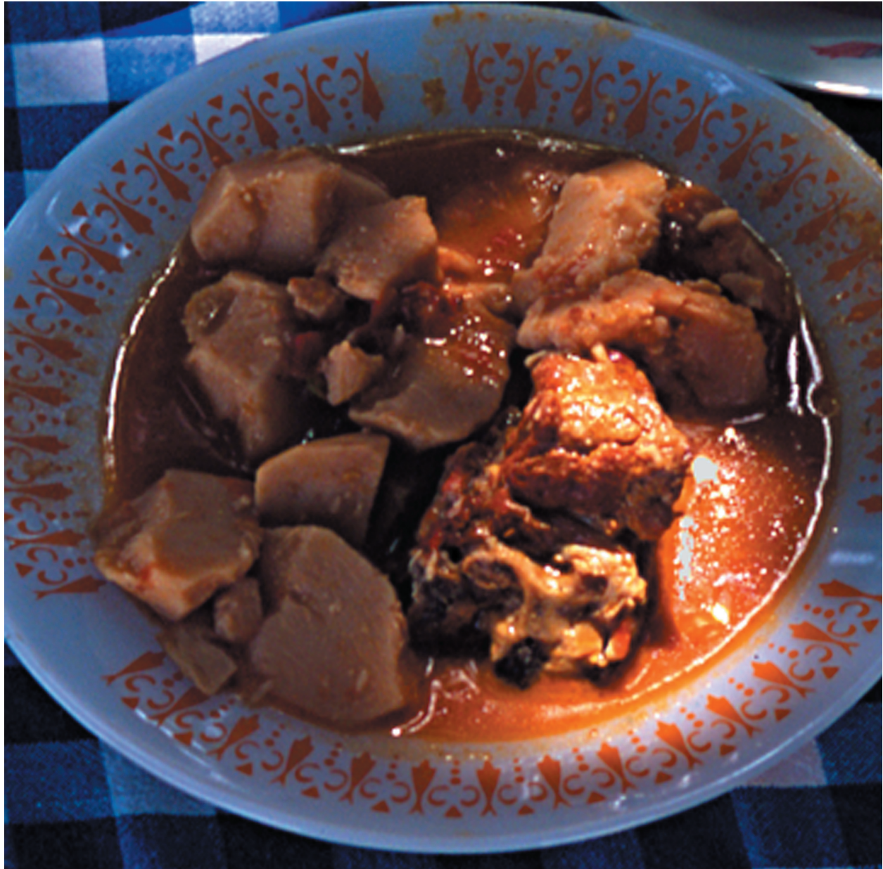
Figure 4. Taro stew in Cyprus ( kolokasi yiakhni ), prepared with taro, onion, tomato, celery, lemon juice and pork (Sept. 1996).

Taro is essentially unknown in central and northern Europe, but is likely to have reached Cyprus in ancient times from India or Africa, via the Levant or Egypt. Taro in Cyprus has been integrated into a cuisine that is best described as Mediterranean. One of my main interests in Cyprus was to see how taro is used by people with a cuisine that is close to European. Most Europeans and their descendants have never eaten taro, or do not enjoy it, but do enjoy Mediterranean food. The author of one New Zealand cooking book has described cooked taro as 'a