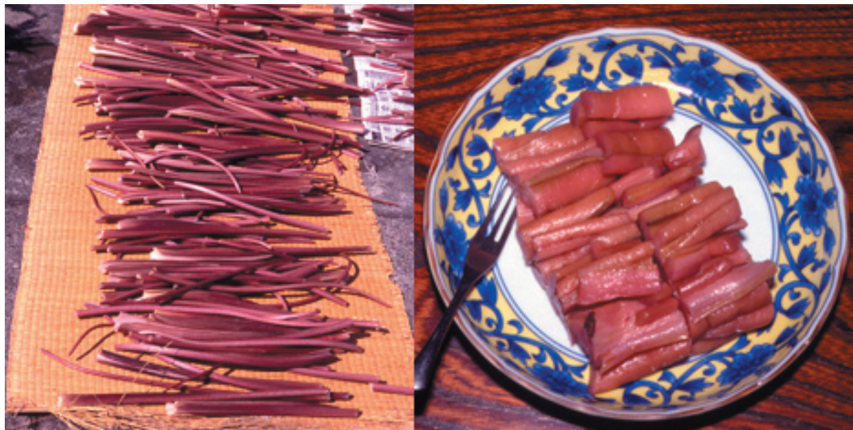
Figure 9. Edible taro petioles ( zuiki ) from a cultivar of C. esculenta ( akazuiki ), (A) placed in sun to dry before peeling and storage, (B) peeled while fresh and served after pickling in weak vinegar. Nigata Prefecture, Japan (Oct. 2000).

- are usually made using the wetland taro (Matthews field notes 2001).