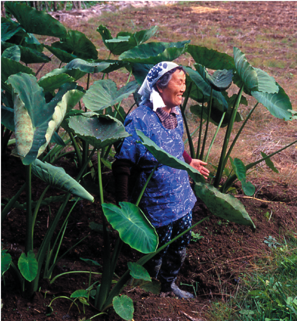
Figure 6. Farmer with dryland taro, Nigata Prefecture, northern Japan (Oct. 2000).

types). Taro in the south can be grown year round, in a continuous temporal succession of crops, although there is some seasonality. Certain recipes are particular to wetland taro, or ta-imo, and other recipes are common to a range of dryland cultivars, which are grouped together as chinnuku. The wetland or dryland distinction is important throughout most of the tropical Pacific.