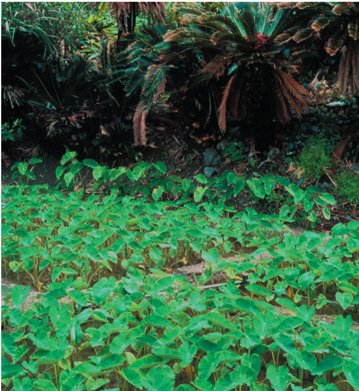
Figure 5. Wetland taro ( ta-imo ) in ponds, below a plantation of a tropical coastal cycad, Cycas circinalis L., Amami Island, Ryukyu Archipelago, southern Japan (April 2001).