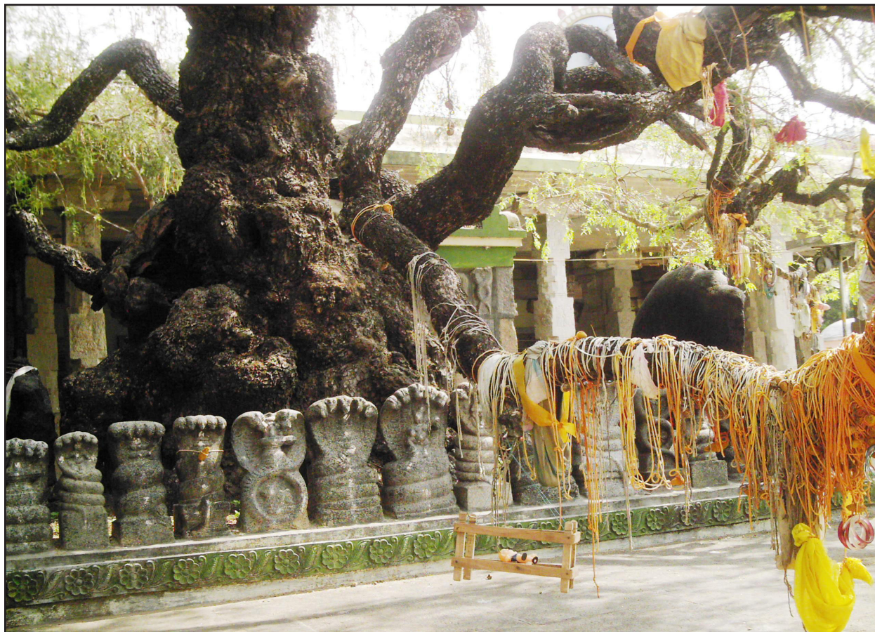
Figure 1. Huge Sthalavrikaha (gbh +800 cm) Prosopis cineraria (L.) Druce with offerings at Vedaranyam Siva temple, in Tamil Nadu, India.

the epigraphs and ancient Tamil literature, sacred hymns and poems.