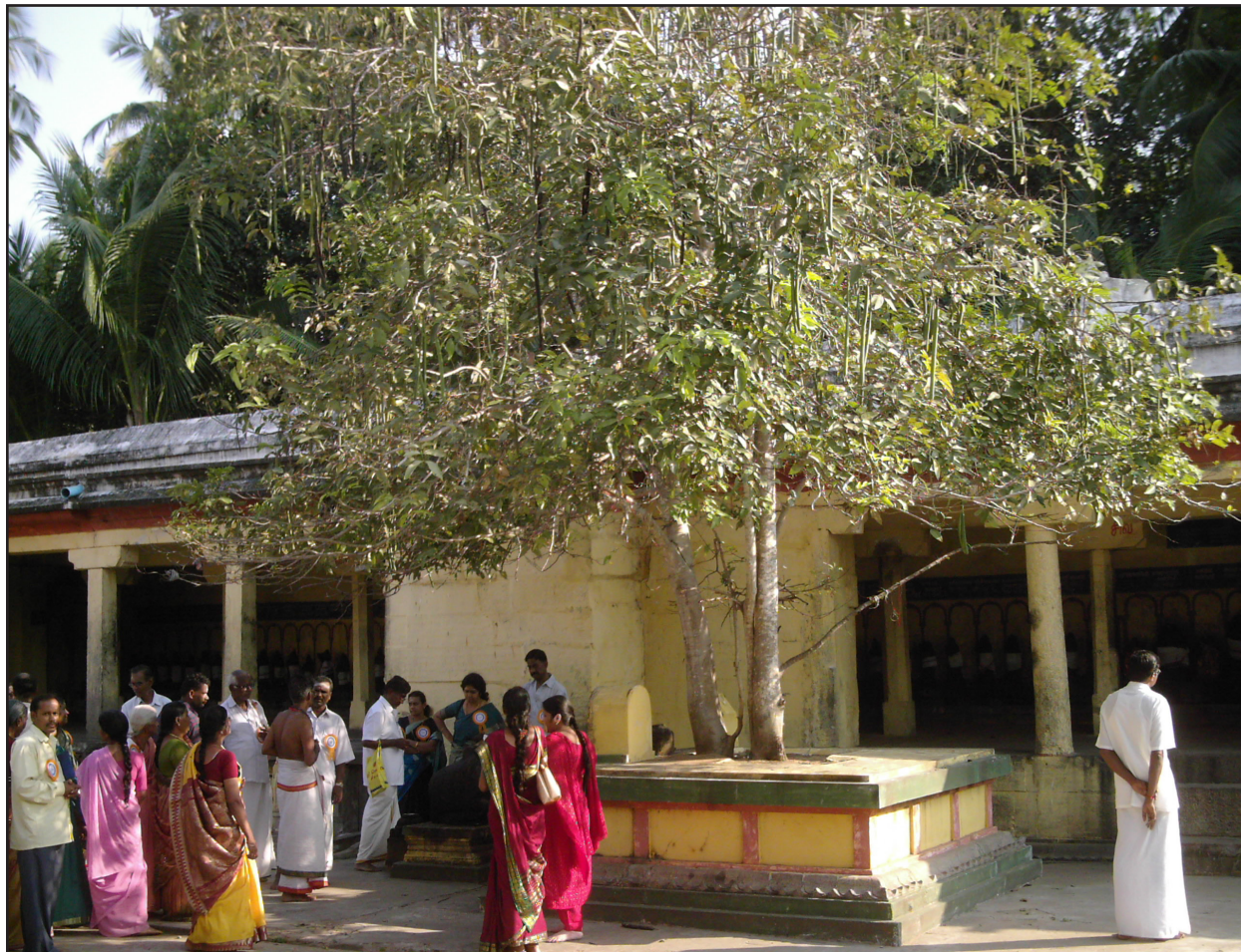
Figure 2. Devotees worshipping Cassia fistula L. at Thiruadigai Siva temple, in Tamil Nadu, India.

as having medicinal uses and 101 medicinal uses Sthalavrikshas were documented. That is to say, 90% of the Sthalavrikshas are used medicinally.