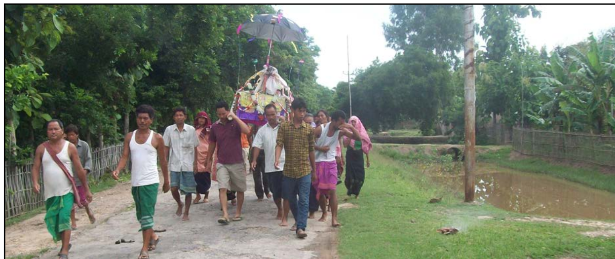
Figure 3. Dead body being carried for Karbi cremation in Karbi Anglong District, Assam, northeastern India. A burning cloth is placed on the ground by a family member (right); the smoke is believed to dispel negative influence by the spirit of the deceased on other families' members.

Additionally, body movement and position are also given priority for preventing bad dreams. For example, sleeping cross-legged is claimed to restrict free movement in dreams. A related example to the role of smoke in controlling influencing spirits can be observed during death of a person. The family burns clothes in front of the house when a corpse is taken to the cremation grounds (Figure 3). They claim the smoke dispels any negative influence by the spirit of the deceased person on living members of other families.