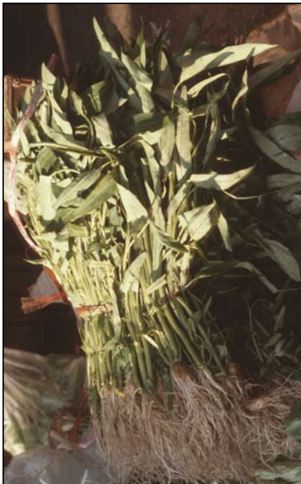
Figure 3. Fresh cuttings in Bangkok market.

Throughout much of tropical Asia this is a common food eaten by all social groups (Burkill 1966, Roxburgh 1824). This potherb is popular across an array of countries as an addition to other foods at mealtime; some eat water spinach two or three times a week (Cornelius et al. 1985). There are several ways people consume these herbs, although the most frequent is a cooked vegetable. A common method is to lightly fry the young tips, including stems and leaves (Westphal 1993). However, tips are also eaten boiled, steamed, or added to soups, stews, curries, sambals (Facciola 1990), and even pickled (Figure 4). Often the branch tips are cooked with onions and chilies, or with garlic, ginger, other spices, shrimp paste, and cuttlefish (Herklots 1972, Wikipedia 2006). Several dishes are regional favorites, such as Cantonese furu ( wéng cài 蕹菜 with bean-curd), and with bean paste and shallots in Hakka cuisine (Fujian, Guangdong, Jiangxi,). Thais stir-fry pak bung with oyster sauce and shrimp paste. In Vietnam