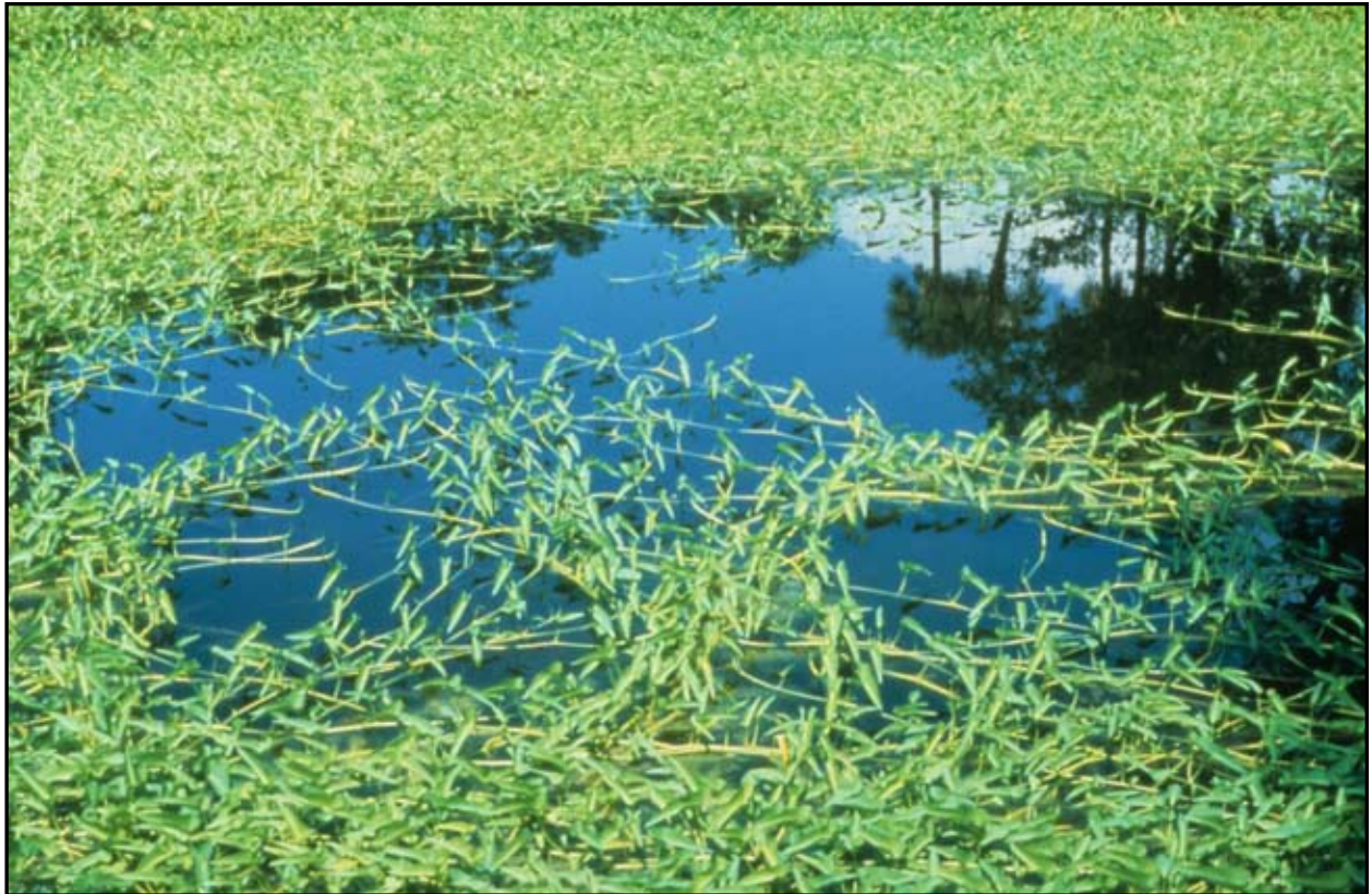
Figure 2. Stems of Ipomoea aquatica growing on a lake in Brevard County, Florida.