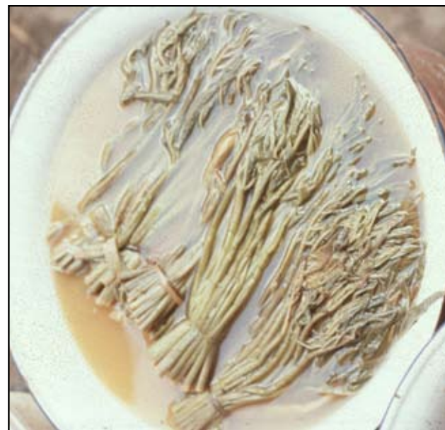
Figure 4. Pickled branches in Bangkok market.