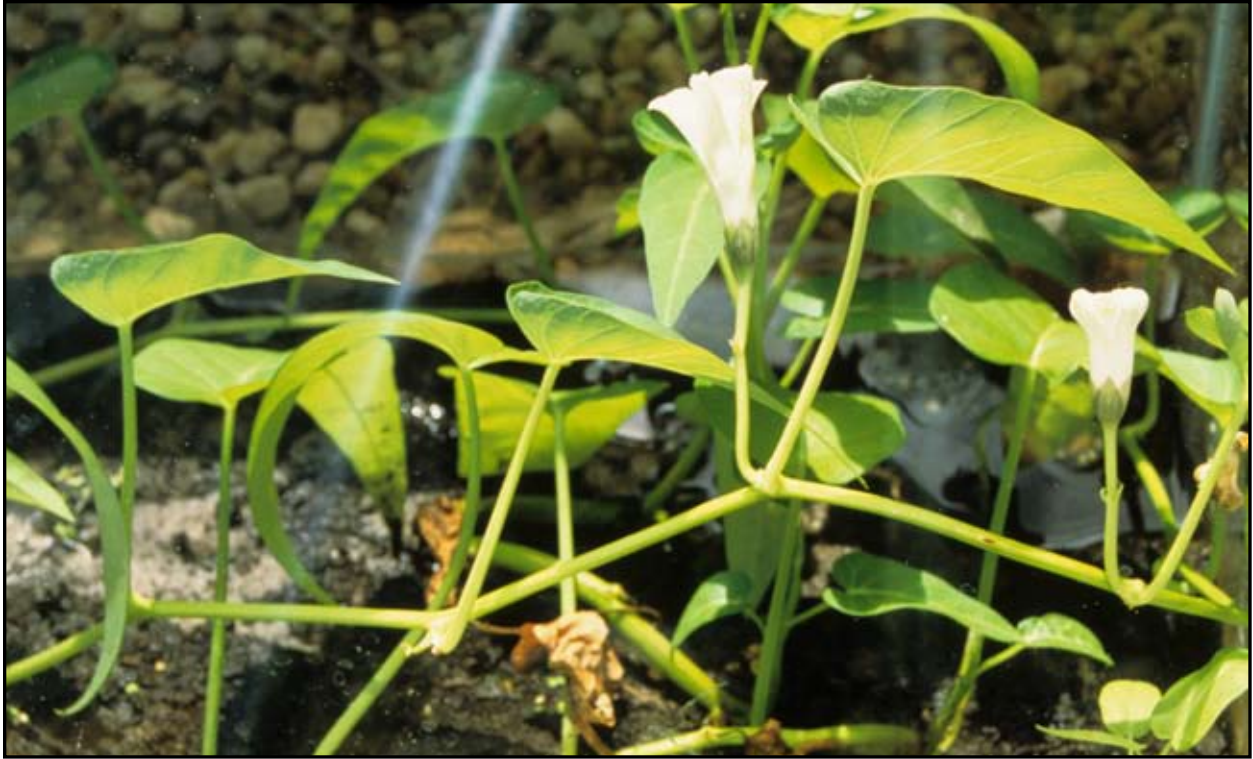
Figure 1. Flowering branch of Ipomoea aquatica on a lake in Brevard County, Florida.