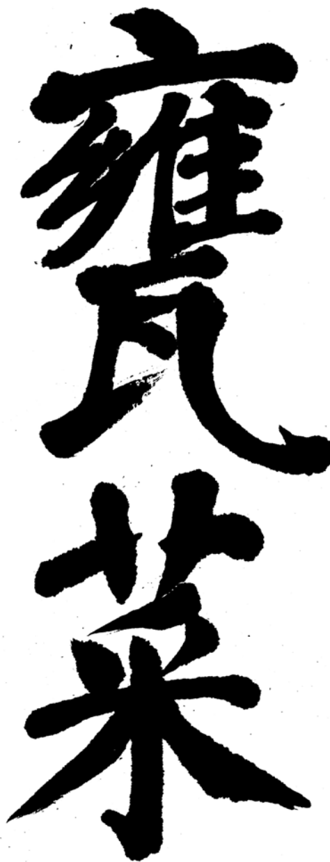
Figure 5. Calligraphy of ong ts'ai [ wéng cài ] 甕菜 written by Shu-Chen Yu Hu.

people loaded provisions on their vessels and the only vegetable that would remain fresh during the voyage was a wild plant along the river banks. They put this 甕菜 in pots and propagated it during the voyage. In Taiwan, they turned this wild plant into an important cultivated vegetable crop. Mainland people were settling on the island of Taiwan by A.D. 1167 and maybe before. Fukienese seem to have been the first on the island although Hakkanese from Hong Kong are also common.