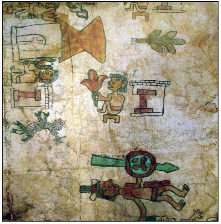
Figure 5 . In the center of this fragment from the Códice de Huamantla (Aguilera García 1984) a local rulers dressed in a red loincloth is seen seated. His low stool arranged in front of his 'noble house' and the flower in this hand, identified as a two-colored cacaloxochitl , are marks of his nobility. To his left another noble (facing upwards) holds what appears to be yolloxochitl (Source: Biblioteca Nacional de Antropología de Historia, Mexico).

The expression 'flower and song', in xochitl in cuicatl , signified the artistic activity of producing and reciting poetry, which was closely allied to élite social groups. This difrasismo <sup>37</sup> points to the importance of nature, and specifically flowers, but also birds, as an inspirations for Nahua lyrical songs, which were typically performed to the accompaniment of music. It directs our attention to the role of plumeria in a poetic genre, which we know from two early colonial collections of songs (Bierhorst 1985a, 2009).<sup>38</sup>