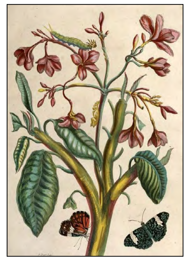
Figure 1 . This early and remarkably accurate image of Plumeria rubra L. (Merian 1719:plate 8) was captured in 1699 in Suriname. It also shows the butterfly and possibly the pupa of Hamadryas amphinone L., 1767 as well as a larva belonging to an unidentified species of Brassolidae on and around P. rubra . Merian noted in her legend to this image of the 'West Indian Jasminetree' that it was the same as Hernández' quauhtlepatli . However, the 'fire plant' ( quauhtlepatli ) of Hernández (1615:24r-24v(I)cap. 2.33) is Euphorbia calyculata Kunth. Merian, as others had done before (Varey 2000:123), conflated Plumeria and Euphorbia based on their similarity in appearance and lactescence.

These observations are relevant for this study, since folk nomenclature often used the color of the flower as a dis-