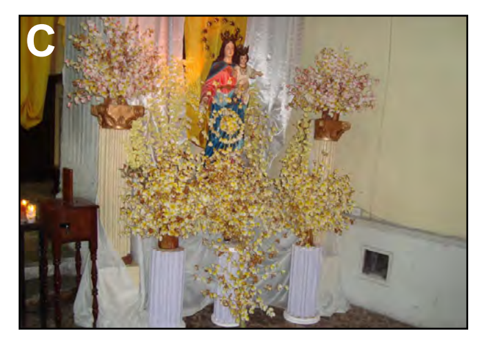
Figure 7 . During Los días de las Enhiladeras de Flores the threading of plumeria blossoms becomes a social acitivity among the participating women in the community of Isla la Flores ( A , B ; Petén, Guatemala). Some of the completed plumeria 'trees' eventually surround the statue of Virgen Maria in church ( C ; May 2010).

In Lombok's graveyards, plumeria trees were said to 'have always been there'. To this date Sasak of central Lombok believe that plumerias planted around a grave will on the one hand facilitate propitious contact with invisible spirits and carry prayers upwards with their fragrance, on the other hand the plants will deter the attacks of witches by masking the scent of the corpse (Telle 2003:95-97, 101). A similar rationale is at work in Muslim communities in Ternate (Moluccas) where the sweet smell of būŋga kambōja (plumeria blossoms) growing around ancestral grave sites, which are also covered with fine-cut leaves of fragrant pondok ( Pandanus sp.), thwart the assault of witches and promote contact with the ancestors (Bubandt 1998, Bubandt 2012 personal communication).